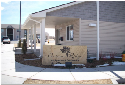
TWO BEDROOM/ONE BATH 800 SQFT