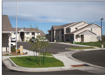
THREE BEDROOM 1050 SQFT